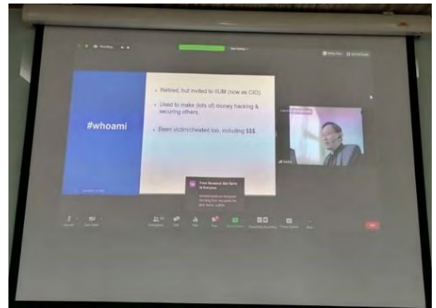
Paper Presentation by Speakers