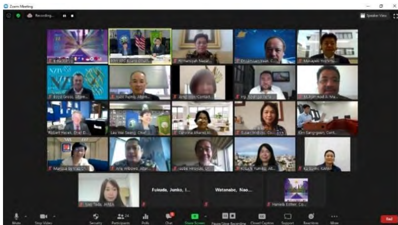
Delegates at the 30 th PPC Board of Directors Meeting

A few important decisions were made, including milestone amendments to the PPC Bylaws which was formulated in 1973.