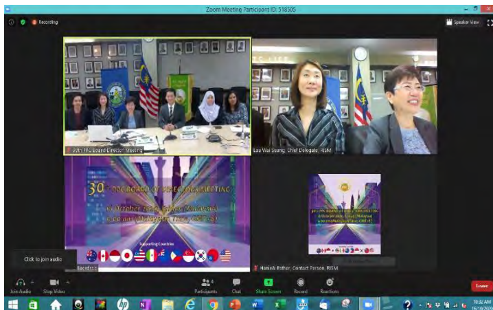
Screen grab of the 30 th PPC Board of Directors Meeting