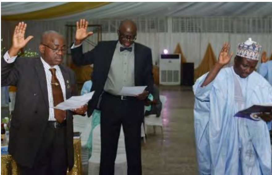
Some of the new Fellows of the NIQS taking their oath of allegiance during the Fellows' Investiture which held in Minna, Niger State.