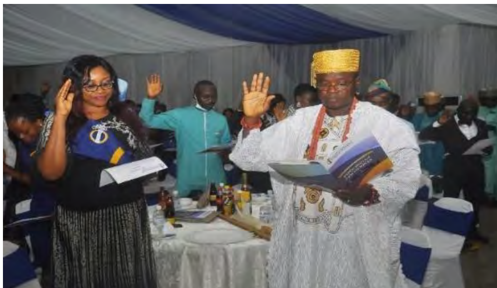
A cross section of newly inducted members of the Institute taking their oath of allegiance during the Induction Ceremony which held in Minna.