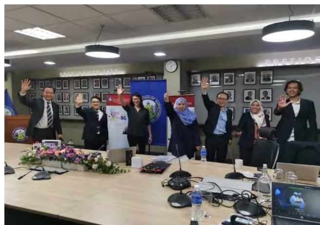
Committee Members and the RISM Secretariat – WORK DONE