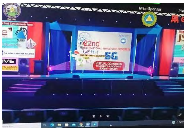
Lobby of the Congress in video type – RISM Secretariat

The Congress received overwhelming responses from RISM members as it was the first ever virtual ISC organised due to the spike of COVID-19 cases where physical events were still not allowed taking into the account the safety of the participants. Total participants registered was 403 inclusive of speakers, committee members and Councillors. There were 364 paid participants out of this list. Below are some of the photos for sharing.