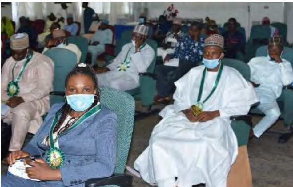
A few of the participants paying rapt attention during the Pre-AGM workshop which were held in Minna.