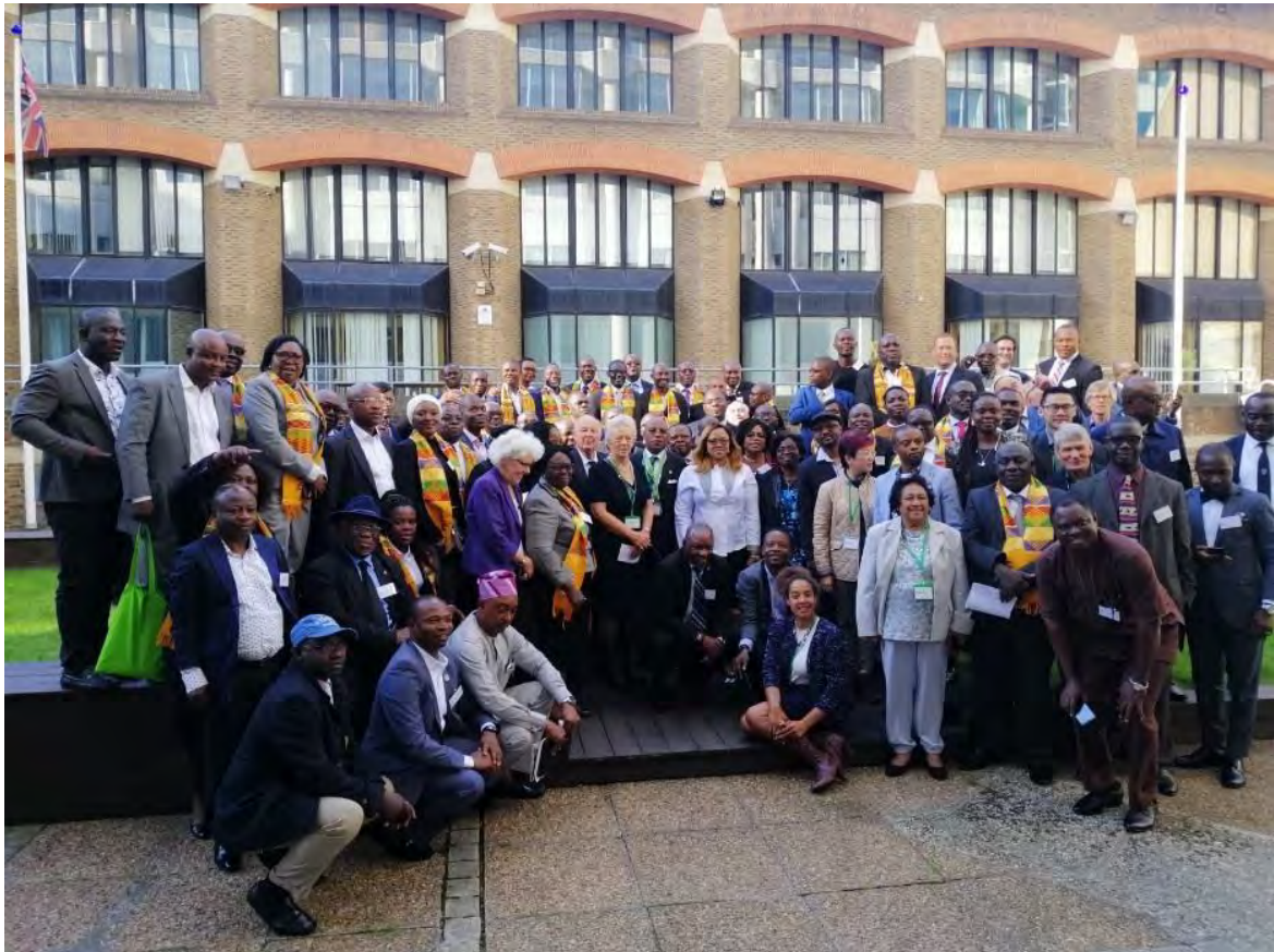
Delegates at the CASLE Golden Jubilee conference at etc.venues, Pimlico, London on Thursday 12 th and Imperial College, London on 13 th September 2019