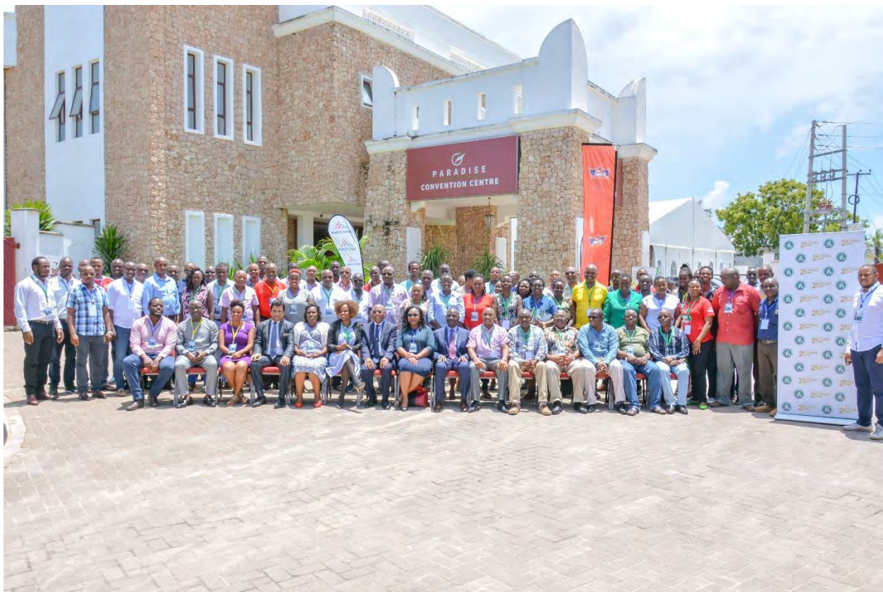
Delegates at the Annual Summit of the Institute of Quantity Surveyors of Kenya on Thursday 24 th and Friday 25 th October at the Pride Inn, Paradise Resort Mombasa, Kenya